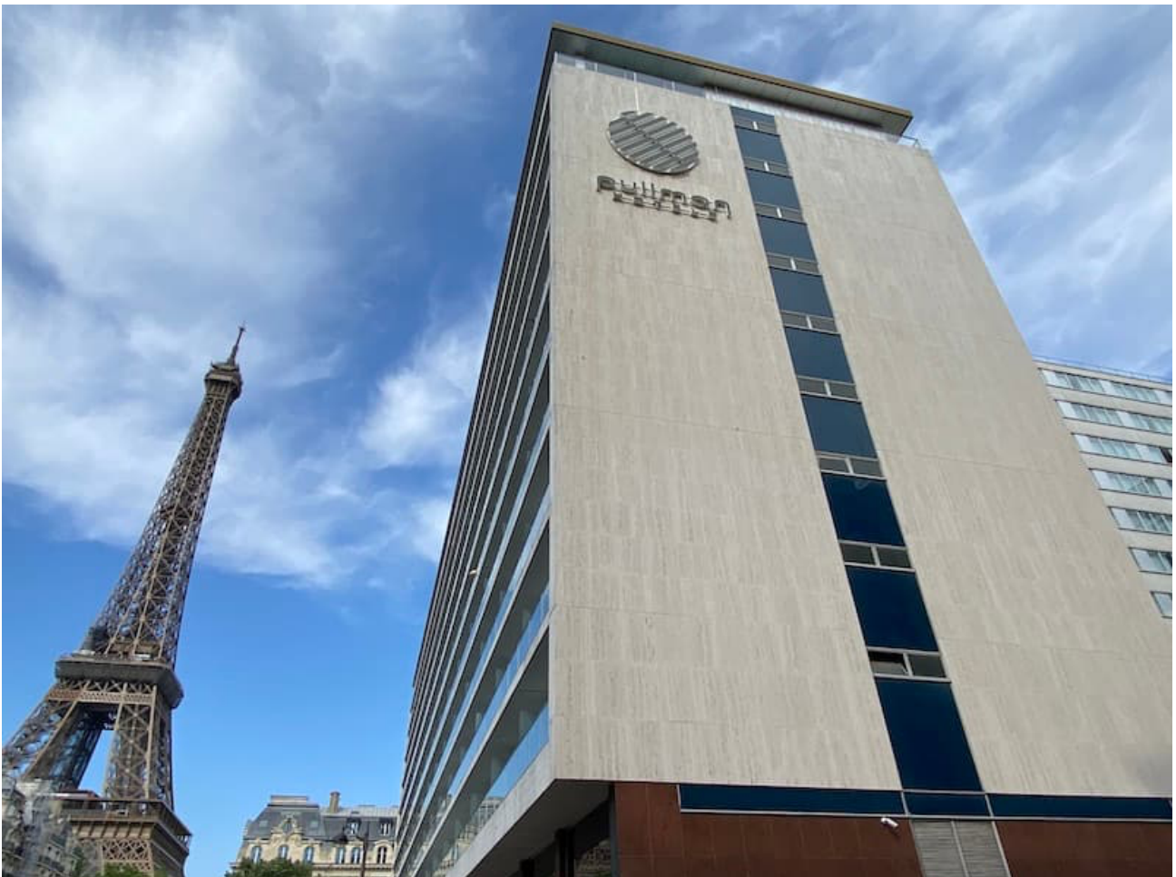
Pullman Paris Tour Eiffel featuring many Eiffel Tower view rooms

Simple, modern, and colorful, the Pullman Paris Tour Eiffel offers comfort and value right at the foot of the Tower. Known for its delicious breakfasts and attentive staff, this is a great landing spot to begin your exploration of Paris. And if you're looking for a Paris hotel with a view of the Eiffel Tower, you're in luck with the Pullman — all the rooms offer a look.