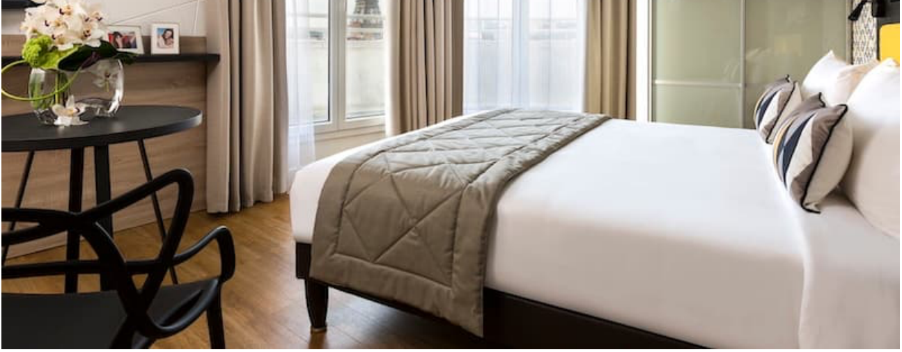
Photo Credit: Citadines Tour Eiffel, Studio Deluxe Eiffel Tower View with Balcony.

Located just a few minutes walk from the Eiffel Tower, Citadines Tour Eiffel offers modern, fully-equipped apartments, some of which offer stunning views of the tower. In the 1-Bedroom Apartment with tower views, you'll find room for four people: one double bed and one double sofa bed, which can be a bit of a rare find in European hotels.